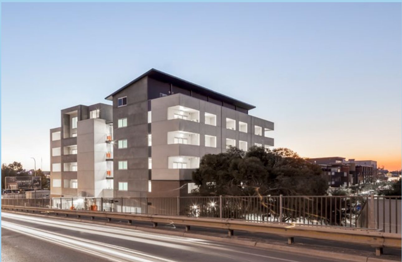
Nexus Apartments, Bowden SA